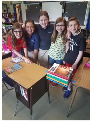
WINNERS (pictured on left)